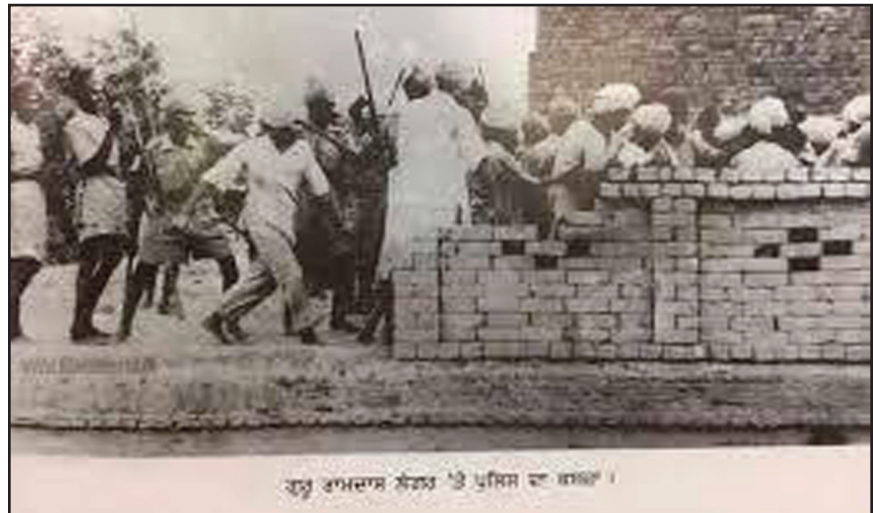
Picture from Police entry into Darbar Sahib (Golden Temple) complex in July 1955 to arrest the activists of Punjabi Suba

British India was organized by British to suit their administrative needs rather than cultural or geographical sensitivities. Historically, India was rarely one political entity but rather a mixer of many independent states, languages and customs. Indian National Congress had promised to reorganize British India after independence based